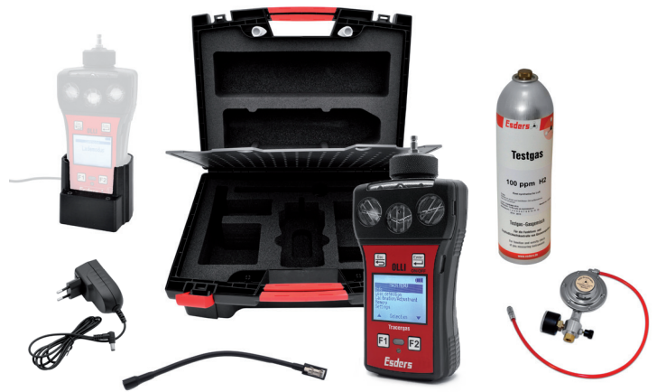
OLLI Tracer Gas in a set