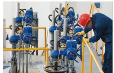
▲ Other Industries