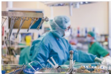
▲ Food & Pharmaceutical Industry