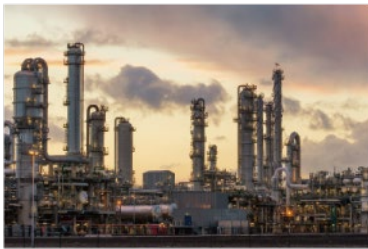
▲ Petrochemical & Chemical Industry