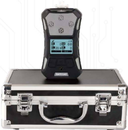
SKY3000 — Portable gas detector

SKY3000 series is a high-performance portable gas detector that can detect multiple gases (1-5 gas types). It has humanized operation functions such as one-key security detection, one-key storage, automatic image flipping, as well as the man down alarm function; With optional Bluetooth transmission function, allowing safety personnel to obtain real-time data and the alarm status. It has obtained international IECEx, ATEX explosion-proof certification and Chinese explosion-proof certification; As it passed the antistatic test, and the protection level reaches IP67; With safer product design and the module design which makes the detection faster, and the compact ergonomic design makes the device easy carrying; The explosion-proof Grade of the SKY3000 series is Ex ia IIC T4 Ga, which is applicable to the explosive gas mixture zone 0, zone 1, and zone 2 of the factory with grades II A, II B, and II C and temperature group T1~T4.