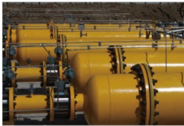
▲ Municipal Engineering & Utilities