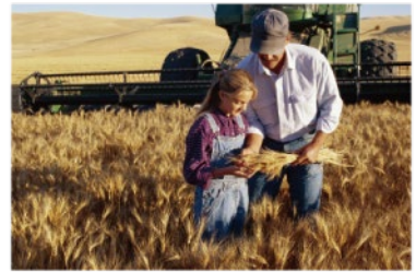
▲ Agricultural & Environmental Protection